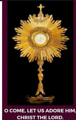
O COME, LET US ADORE HIM, CHRIST THE LORD.